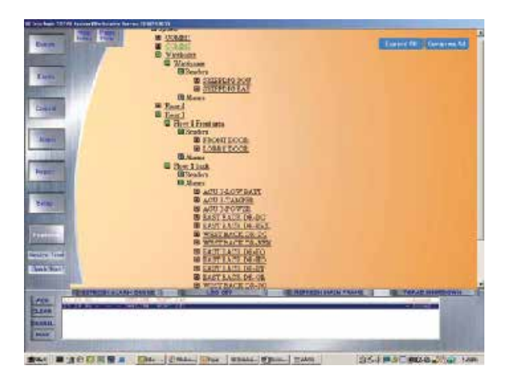
Device Tree displays the system's configuration.

The Topaz interface gives you a familiar browser-style environment in which to administer and operate the system. Dynamic alarm, reader, security area, and relay icons are displayed on color maps or other images in standard graphic file types. The icons have full drill-down capabilities to the device level. Use simple mouse clicks on the appropriate icons to acknowledge alarms or operate, arm or disarm individual devices and doors or complete security areas.